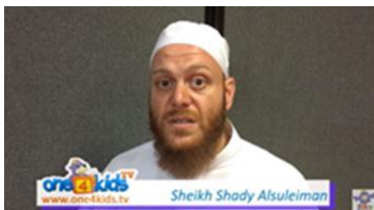
Figure 3. Sheikh Shady Alsuleiman, President of ANIC ( Australian National Imams Council )

company launched a funding page on the LaunchGood website, which has raised more than $5,000 of the $20,000 needed to start production.