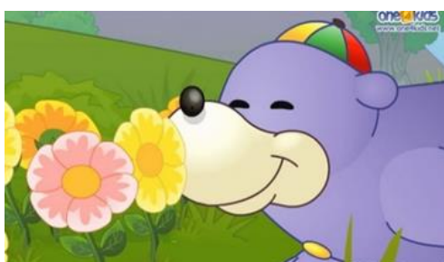
Figure 6. Zaky as the Main Character of One4kids Animation

One4kids is a Muslim cartoon series production company. A cartoon series that provides life lessons with Islamic educational values. The way of delivery that is easy for children to understand, One4kids is an alternative to planting education or education that is easily accessible anywhere and anytime. The main character in the One4kids animated series is Zaky. Zaky is a goofy-looking purple bear with a propeller on his head, but Zaky is well on achieving cult status among young Muslims in Australia and beyond. Zaky also aims to dispel some harmful stereotypes about Islam among non-Muslims.