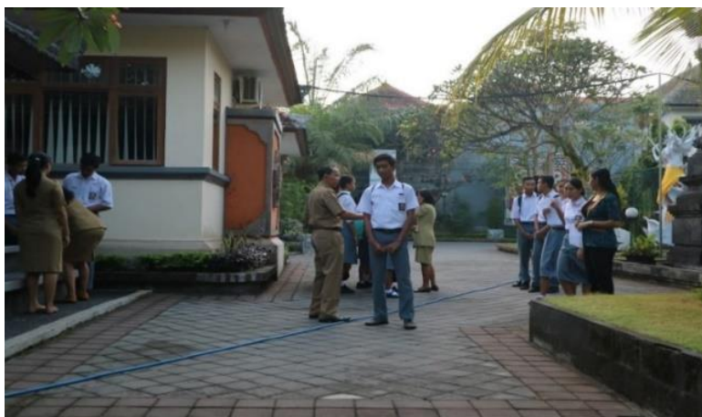
Figure 5. Confidential Documentation on the Use of School Attributes

According to the findings of parent interviews, teachers have imparted the values of character education, honest discipline, and kinship through the supervision carried out by parents. The school also strives to constantly supervise its students by keeping secrets or speaking to all students, both for student learning equipment and luggage, as this will significantly aid the school in acclimating to a simple lifestyle. They supervise students when using school tools or when they need them.