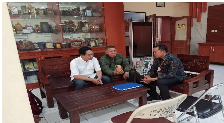
Figure 2. Documentation During the Interview with Vice Principal

Based on the records in the pocketbook, if violations committed by students starting from score four and above are certain, aka involving parents or guardians. In this situation, the school or teacher builds communication with the student's parents. The parents are aware of this situation because, at the beginning of the admission of new students, the parents have signed a contract or form of employment contract containing school discipline rules for those who will get points where later each point has its action.