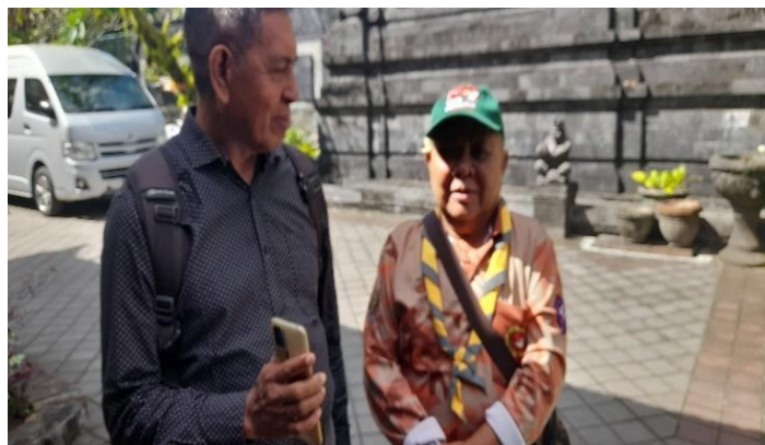
Figure 4. Documentation with Student Parents

Teachers and parents are essential to work together. Cooperation between teachers and parents in building honest, disciplined, and familial character begins with getting children to live simply. It is a challenge for teachers and parents today when children are spoiled with a life that uses technology to facilitate everything. Therefore, both must increase the intensity of their cooperation with each other so that children or students stay manageable to impress a luxurious life. Parents can foster and form discipline and simple living at home. At the same time, teachers strive to continuously guide and control students to comply with a simple lifestyle as stipulated in school rules.