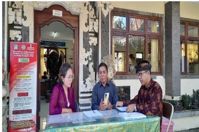
Figure 3. Interview Documentation with Teachers of SMAN 3 Denpasar

Based on the findings of the researchers' observations and interviews with parents and teachers of SMAN 3 Denpasar students, the synergy between parents and schools in shaping disciplinary character is primarily related to communication and coordination. This is carried out to assess students' conditions at home. Suppose there are child problems in terms of applying the rules or rules applied at school because teachers cannot monitor or meet directly with students. In this condition, those who play a significant role in monitoring students are parents at home. As a result, if parents and teachers communicate well, coordination may be successful.